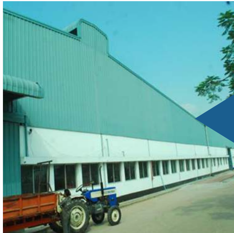
NASSA TAIPEI DANIM (BD) LTD., COMILLA EPZ