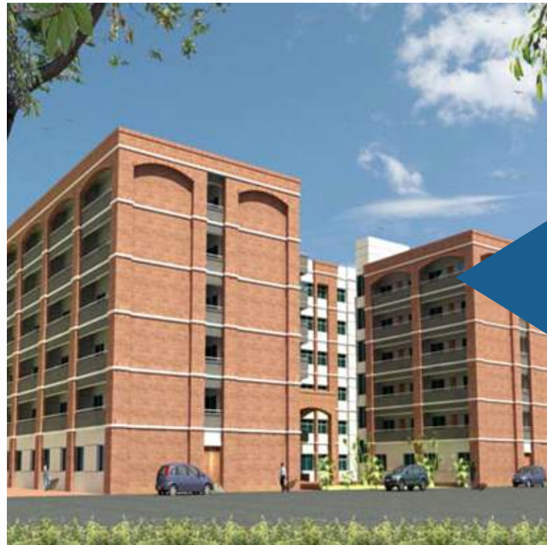
NARI PROJECT AT KEPZ, DORMITORY-1, KEPZ, CTG.