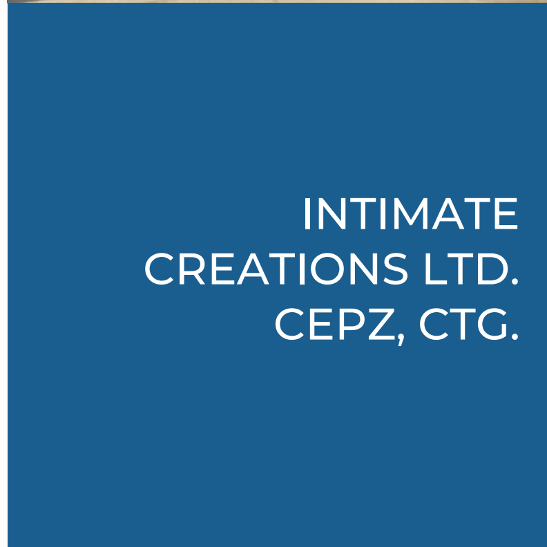
INTIMATE CREATIONS LTD. CEPZ, CTG.