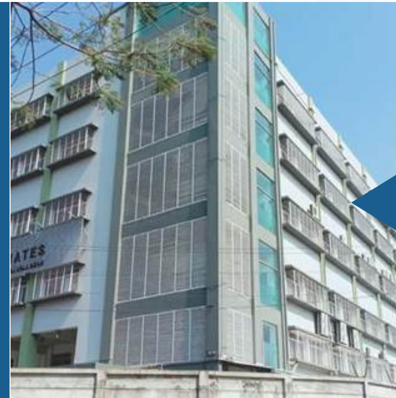
MAS INTIMATES BANGLADESH (PVT) LTD (KEPZ)