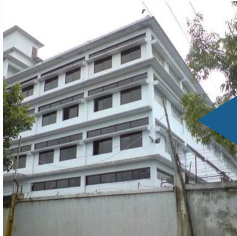
PREMIER TOWELS (BD) LTD, UNIT-1, CEPZ