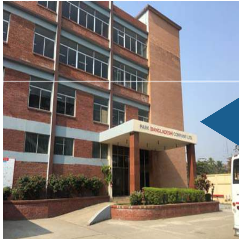
PARK BANGLADESH COMPANY LTD. KEPZ, CTG. UNIT-2