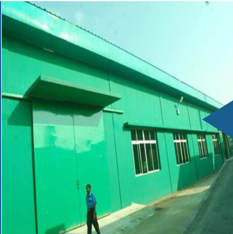
EUSEBIO TEXTILES(BD)LTD. COMILLA,EPZ.