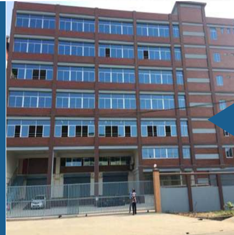
PARK BANGLADESH COMPANY LTD. KEPZ, CTG. UNIT-1