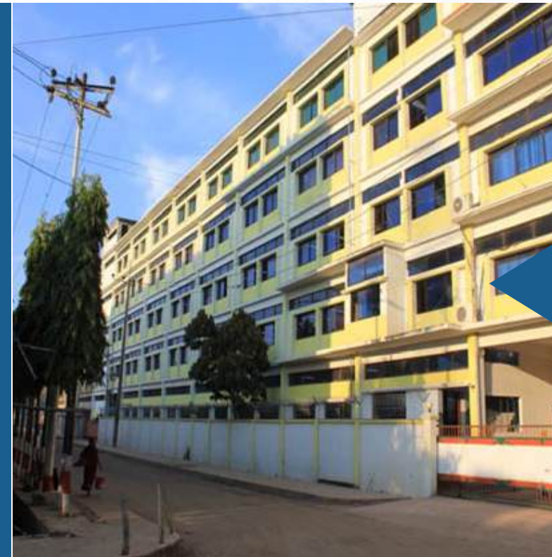
MZM TEXTILES LTD, CEPZ.,Chittagong