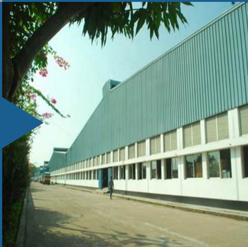
MZM (CEPZ) LTD., CEPZ, CTG.