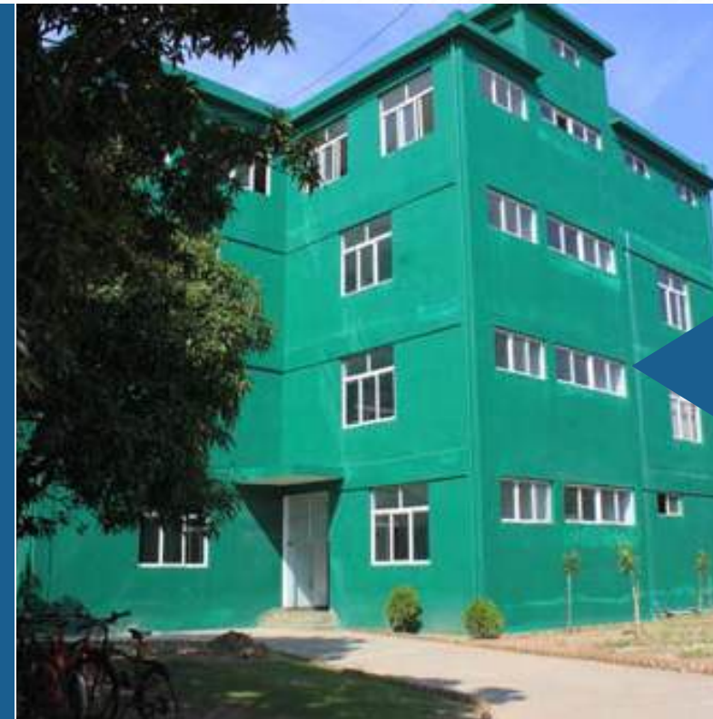
EUSEBIO WARE HOUSE(BD) LTD.,KEPZ CHITTAGONG