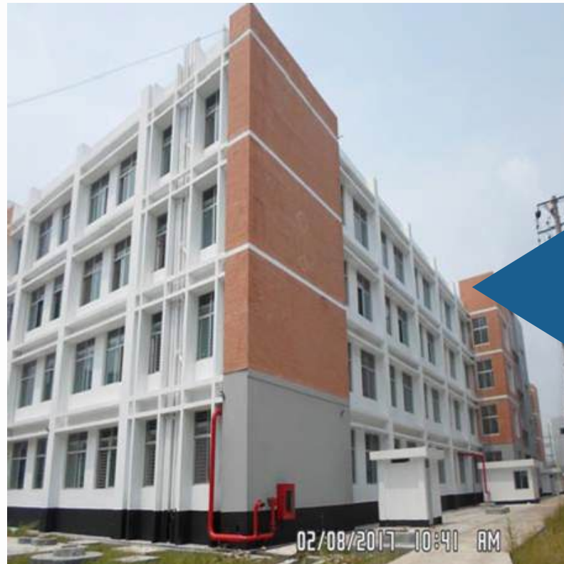
BEPZA BUILDING CUMILLA EPZ, CUMILLA