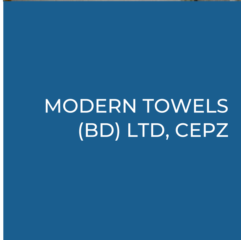
MODERN TOWELS (BD) LTD, CEPZ