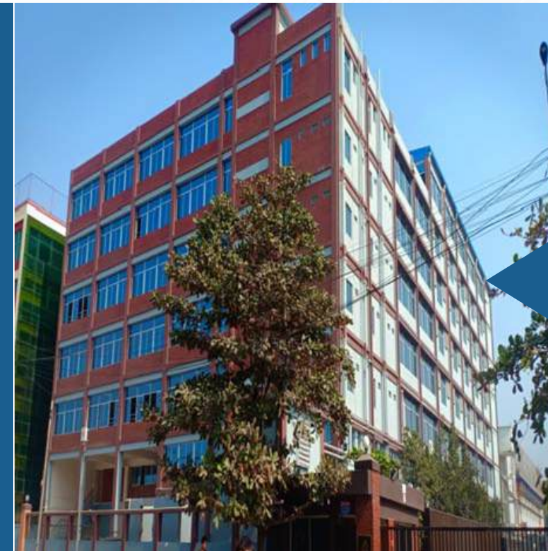
INTIMATE APPARELS LTD. KEPZ, CHATTOGRAM