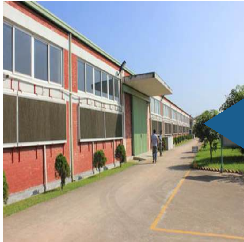
EUSEBIO SPORTING(BD) , LTD, KEPZ,CHITTAGONG