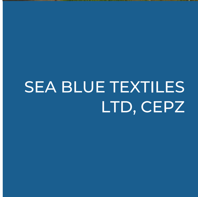
SEA BLUE TEXTILES LTD, CEPZ