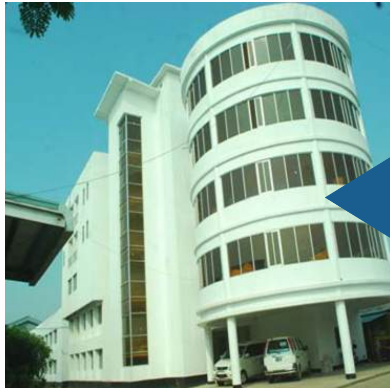
NASSA TAIPEI DENIM DENIM LTD, COMILLA EPZ