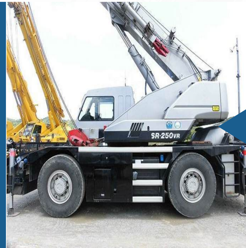
PICTURE OF 25MT CRANE