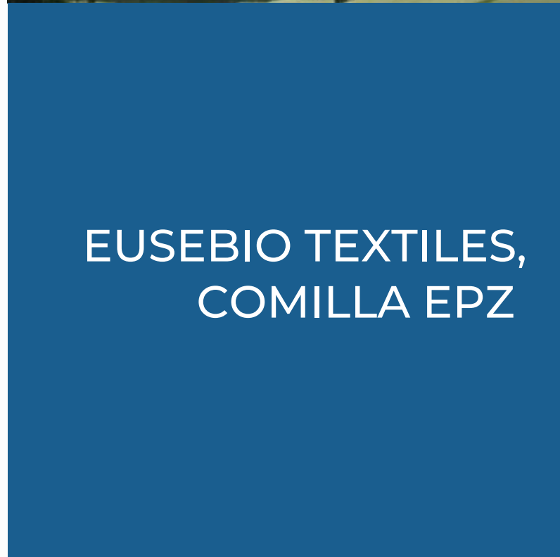
EUSEBIO TEXTILES, COMILLA EPZ