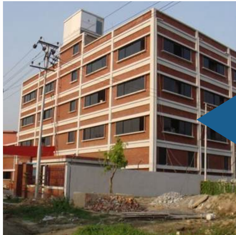
MAINETTI (BD) LTD, R.C.C UNIT, DEPZ