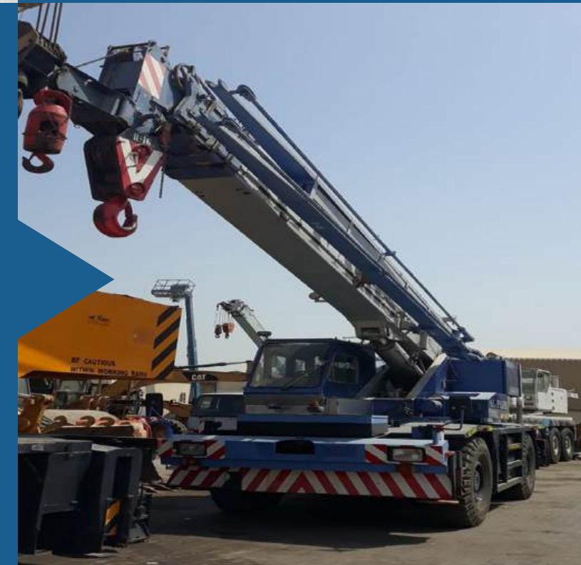
PICTURE OF 35MT CRANE