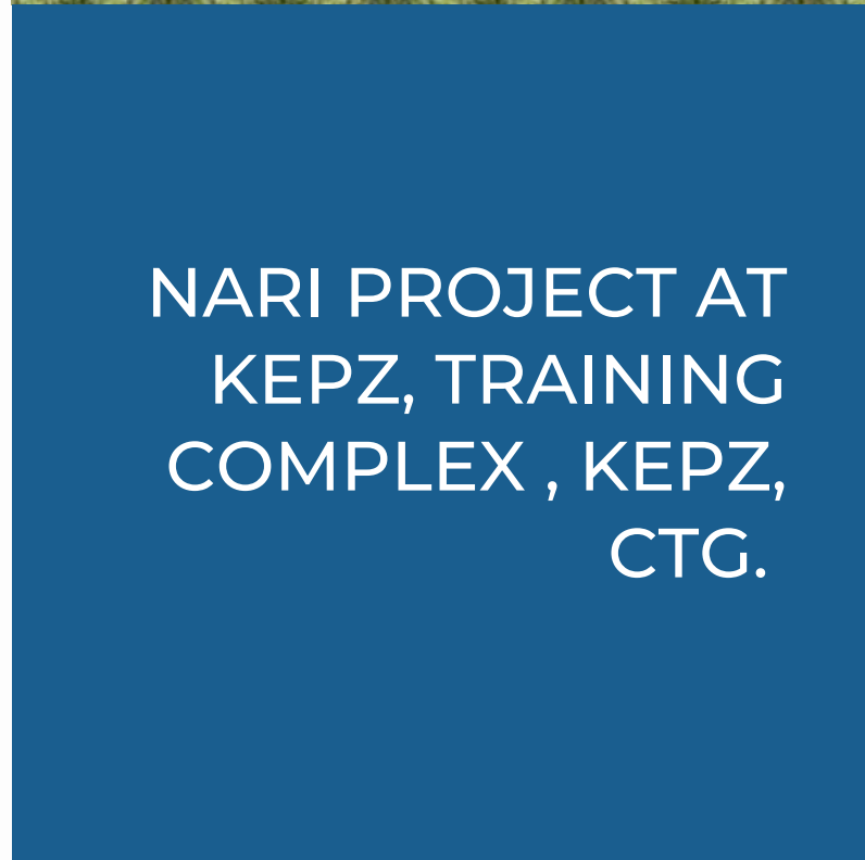
NARI PROJECT AT KEPZ, TRAINING COMPLEX, KEPZ, CTG.