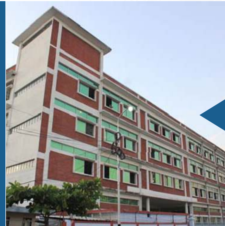
MITALI TEXTILES (BD) LTD, CEPZ