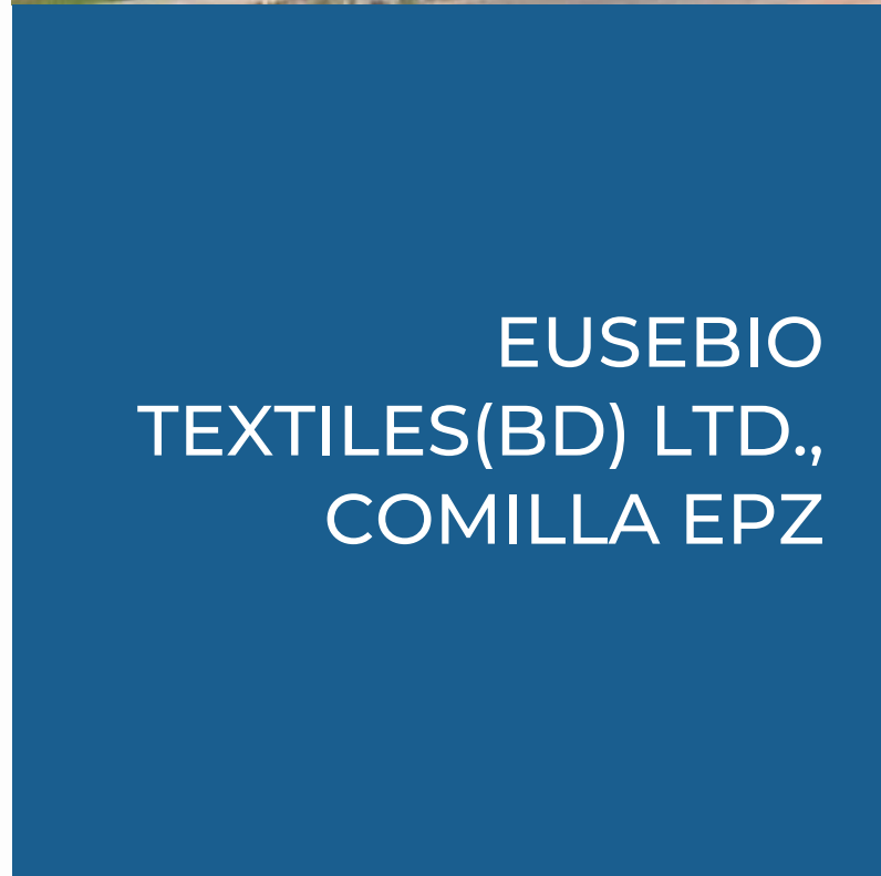
EUSEBIO TEXTILES(BD) LTD., COMILLA EPZ