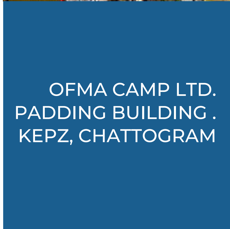
OFMA CAMP LTD. PADDING BUILDING . KEPZ, CHATTOGRAM