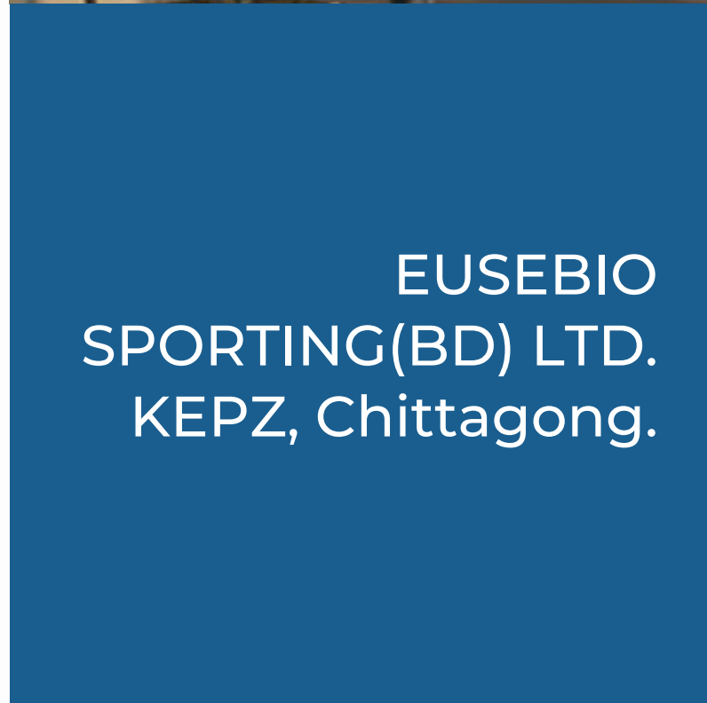
EUSEBIO SPORTING(BD) LTD. KEPZ, Chittagong.