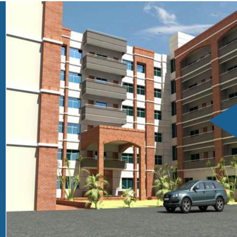
NARI PROJECT AT KEPZ, DORMITORY- 2, KEPZ, CTG