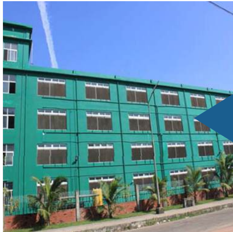
EUSEBIO SPORTING (BD), LTD, KEPZ,CHITTAGONG