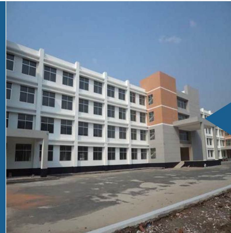
BEPZA BUILDING CUMILLA EPZ, CUMILLA