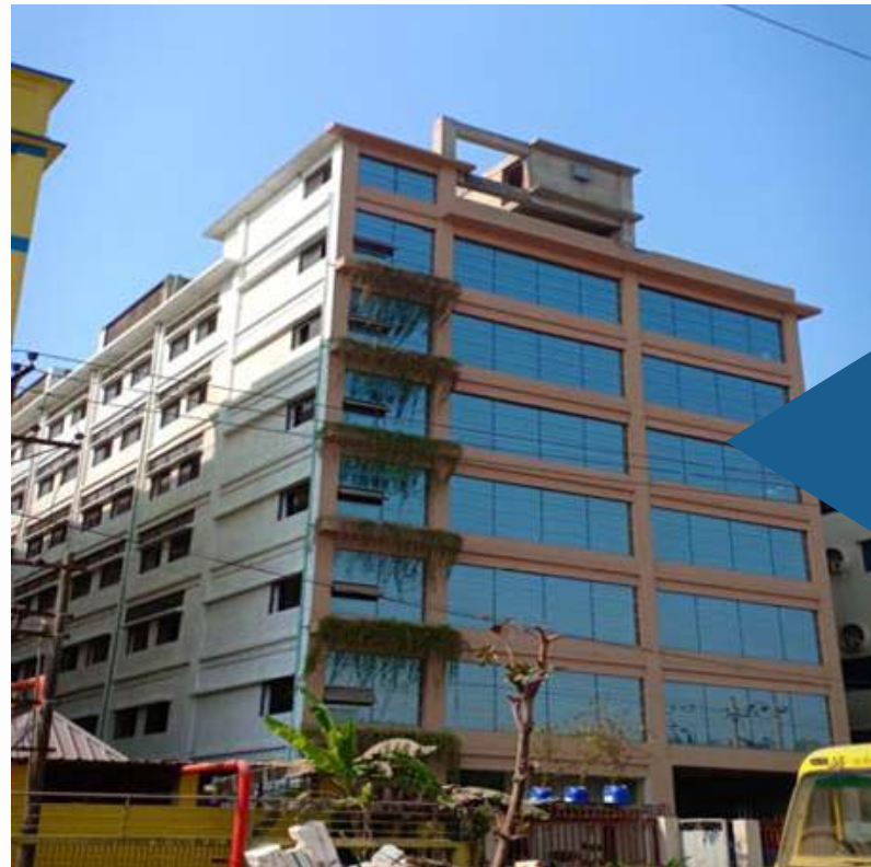
SOS OUTFITTERS LTD.KEPZ, CHATTOGRAM