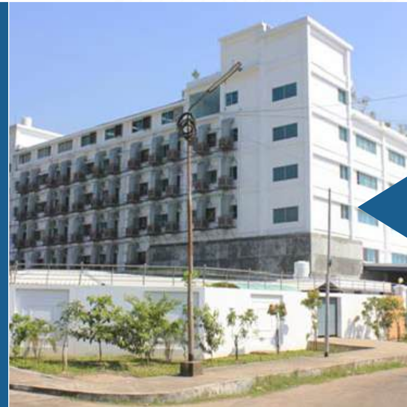
RHYTHM DRESS MAKER LTD.,KEPZ CHITTAGONG